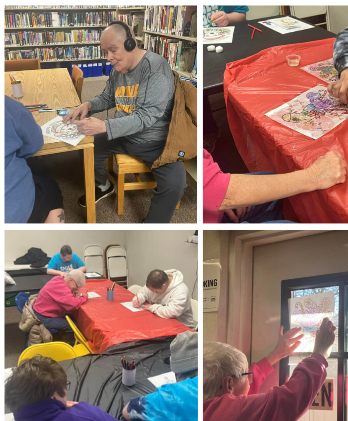
Imagine Part 2

Our friends from Imagine joined us in making holiday themed stained glass pictures!